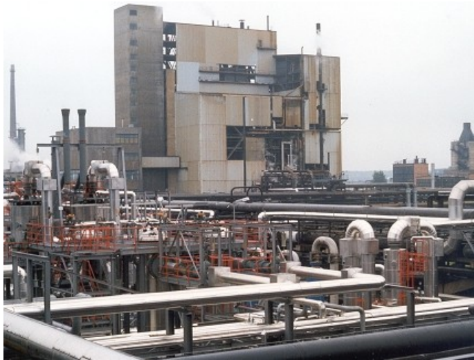
Figure 1: Illustration of the 130 MW(th) GSP – GASIFIER in operation at `Schwarze Pumpe`, Saxony since 1987