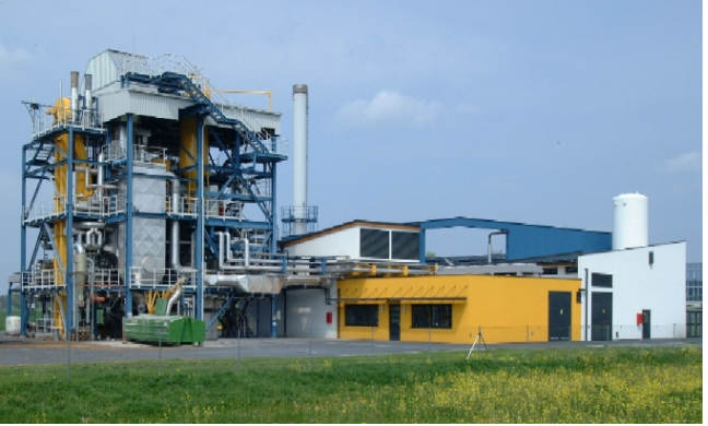
Biomass steam gasification plant at Güssing, Austria.

TUV has successfully scaled-up the fast-internal circulating fluidized bed process from a pilot plant at the University to a large-scale, commercial installation in Güssing. Furthermore, the supporting R&D by the research partners has been completed to an extent that allows the industrial partner to bring an economical and commercially viable biomass-driven CHP process to the market.