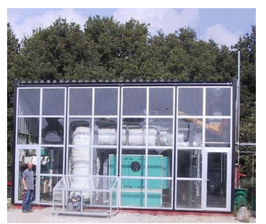
Viking gasifier at DTU, Copenhagen, Denmark

The scale-up of the two-stage process to large capacity plant activities is planned to start in 2004 in co-operation with private companies.