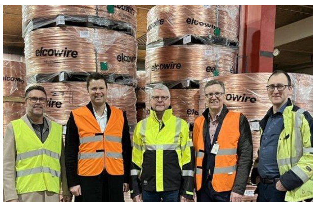
Figure 5. Representatives of MEVA Energy and Elcowire (Photo from MEVA Energy, 2025).

Meva Energy ( https://mevaenergy.com/ ) has entered into a 15-year agreement with Elcowire, a leading European copper wire manufacturer, to supply 9 MW of biomass-based producer gas to Elcowire's production facility in Helsingborg. This will be the world's first copper wire producer to fully replace fossil gas with fossil-free energy. This agreement represents Meva Energy's largest contract to date valued at 50 million Euro.