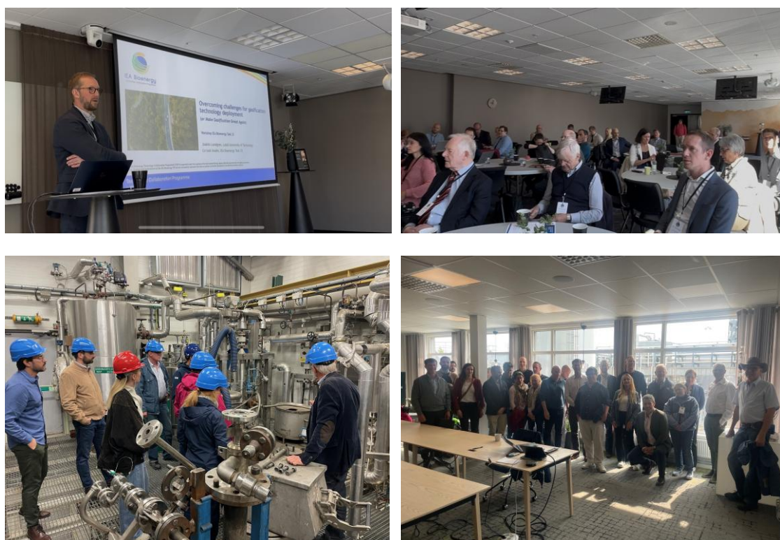
Figure 2. Photos from the workshop in Luleå and the study visits in Piteå.

The workshop consisted of three sessions, technical learnings, policy and regulatory issues and finance and market issues, with eleven presentations in combination with three round-table discussions from different perspectives concerning deploying biomass gasification technologies. Photos from the event are shown in Figure 2.