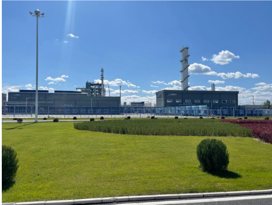
Figure 3. The Shanghai Electric bio-electro-methanol plant in Taonan, China